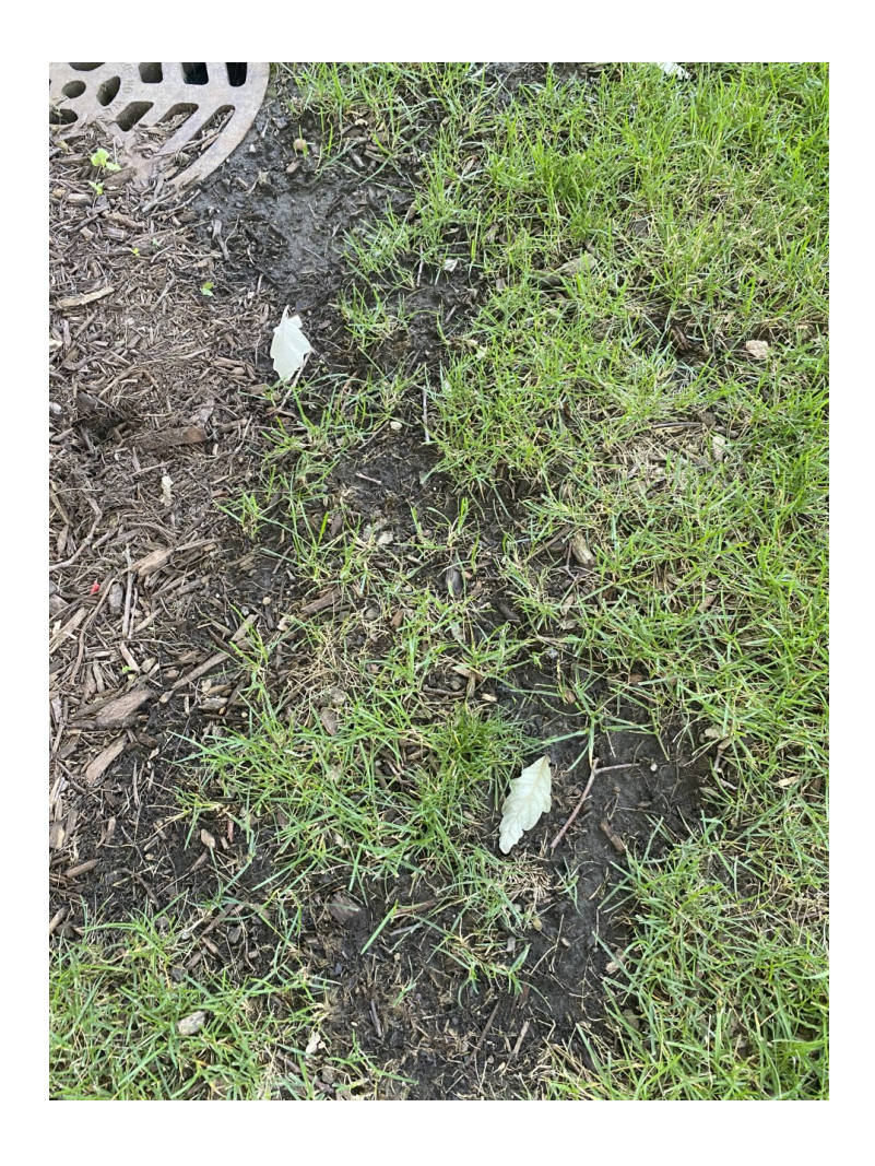
Step 2: Bring your leaves, sticks and petals inside and get a paper plate and some tape (or glue if you have some).