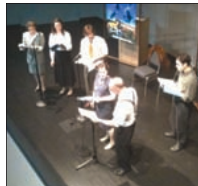
Actors from GreatWorks Theatre Company perform.

A different approach to Anne Frank's experiences was shared January 17, when GreatWorks Theatre Company presented "Anne Frank: On the Air" at the Museum. The play portrayed a group of 1940s radio actors who perform a new script, not realizing the story is true. Audience members interacted with the cast afterwards. ■