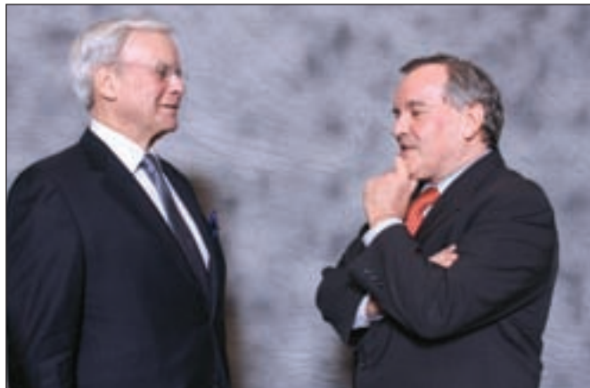
Tom Brokaw and Mayor Richard M. Daley